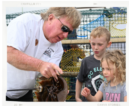
KIDS ACTIVITIES AND TOUCH TANK