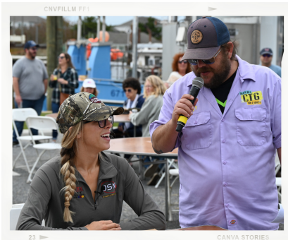
CRAB CAKE EATING CONTEST