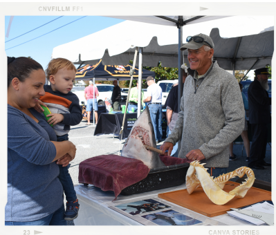
EDUCATION AND MARITIME HERITAGE