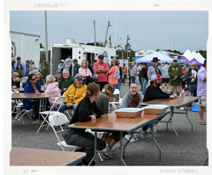
FOOD TRUCK VENDORS