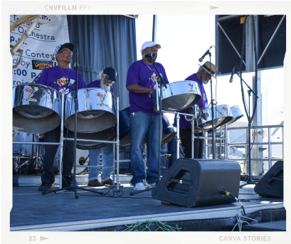
LIVE BAND PERFORMANCES